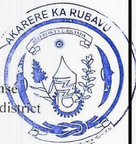
KAMBOGO Ildéphonse The Mayor of Rubavu district